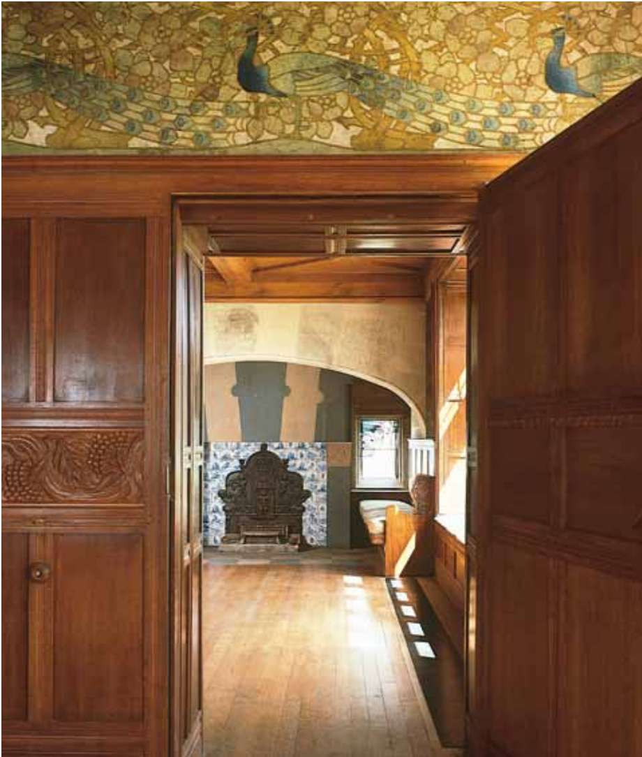
View of the Dining Room from the Main Hall at Blackwell

The Lakeland Arts Trust welcomes groups to Blackwell, The Arts & Crafts House, Abbot Hall Art Gallery and Museum of Lakeland Life & Industry all year round. We enjoy seeing the return of regular groups and introducing new groups to the beautiful properties and collections in the care of the Trust.