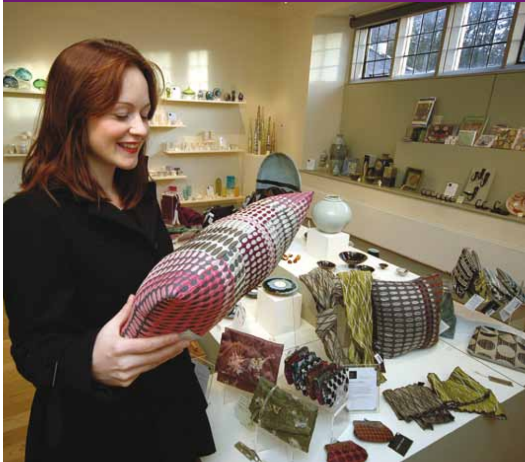
Blackwell's Craft Shop