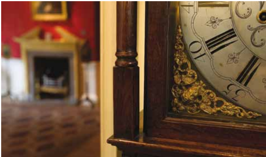
View into the Saloon at Abbot Hall

We offer competitive rates to groups of 10 or more, with additional benefits and incentives for drivers and group organisers. These include:-